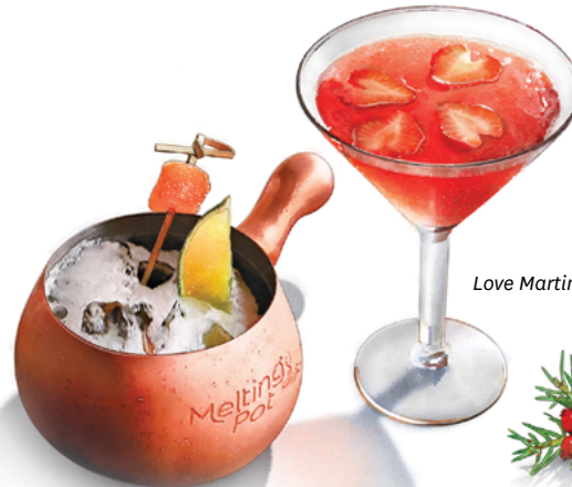
The Melting Pot Mule

WHISKEY BUSINESS | $11 (184 cal) Maker's Mark Bourbon, Jameson Irish Whiskey, Jim Beam Bourbon, Jack Daniel's Whiskey, Lemonade, Filthy Black Cherry Syrup, Coca-Cola, Lemon Wedge, Filthy Black Cherry GF