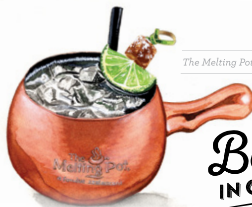
The Melting Pot Mule

BLACKBERRY SAGE LEMONADE (275 cal) 4.95 GF Lemonade | Blackberry | Sage