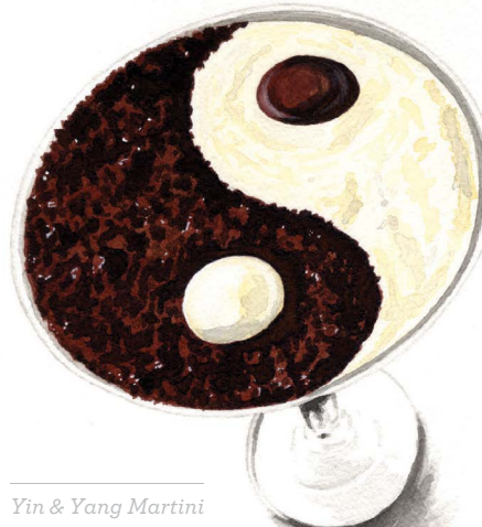
Yin & Yang Martini

WHISKEY THISTLE (217 cal) 9.95 GF Jameson Irish Whiskey | White Peach | Raspberries | Lemon | Sprite