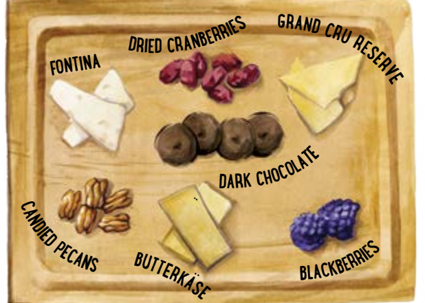
GF - The Partners in Wine Pairing Plate is gluten-free.

OF CAREFULLY SELECTED CHEESES, BERRIES AND NUTS.