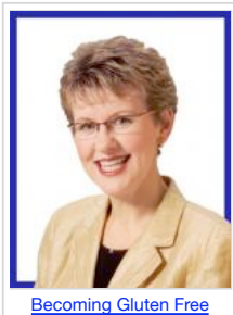
Becoming Gluten Free

Everything you need to know about letting go of gluten!